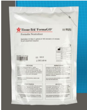
Tissue-Tek® FormaGO Formalin Neutralizer