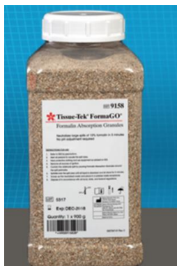
Tissue-Tek® FormaGO Formalin Absorption Granules