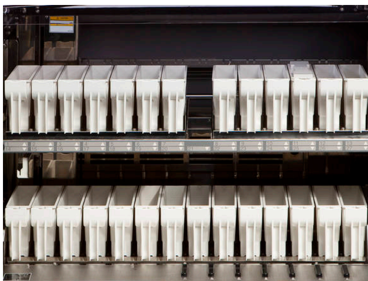
27 reservoirs, 1 drying station

Load up to 440 slides with multiple protocols and simply walk away. For any of the two user-defined start positions, each basket set is automatically picked up and moved to all programmed solution or wash reservoirs. The baskets are then delivered to either one of the user-defined end positions, ready for